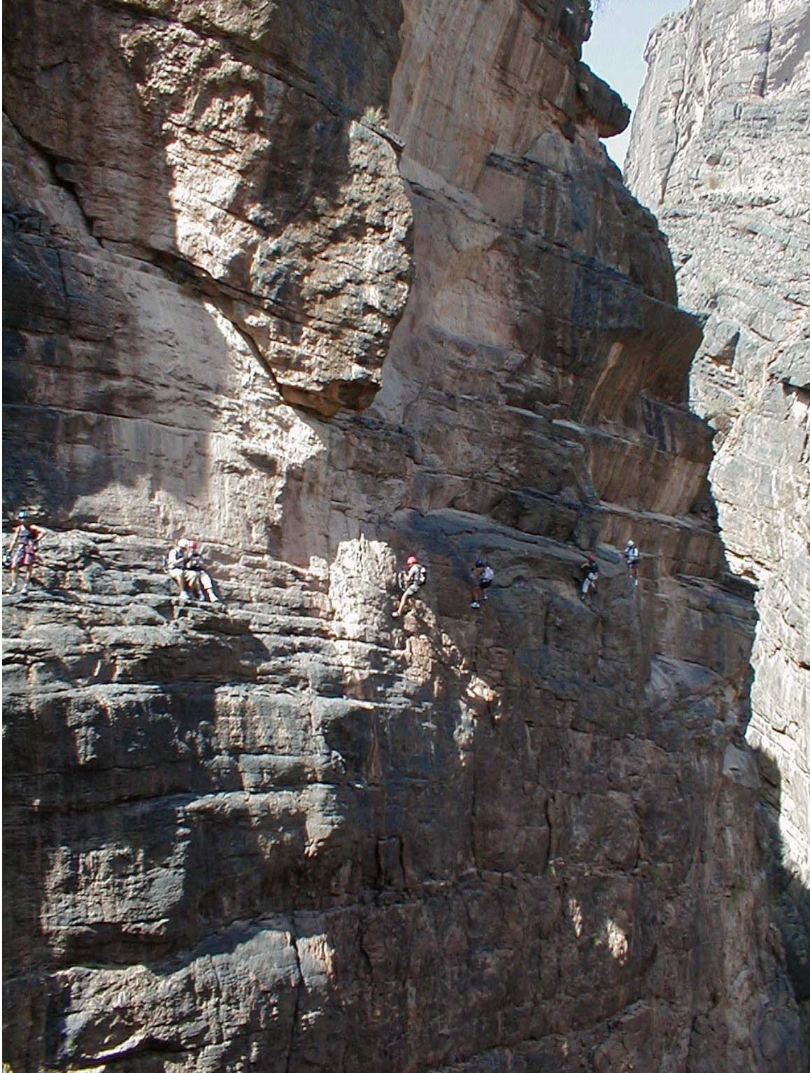
Between the first and second Tyroleans